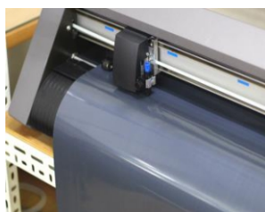
Design & Cut